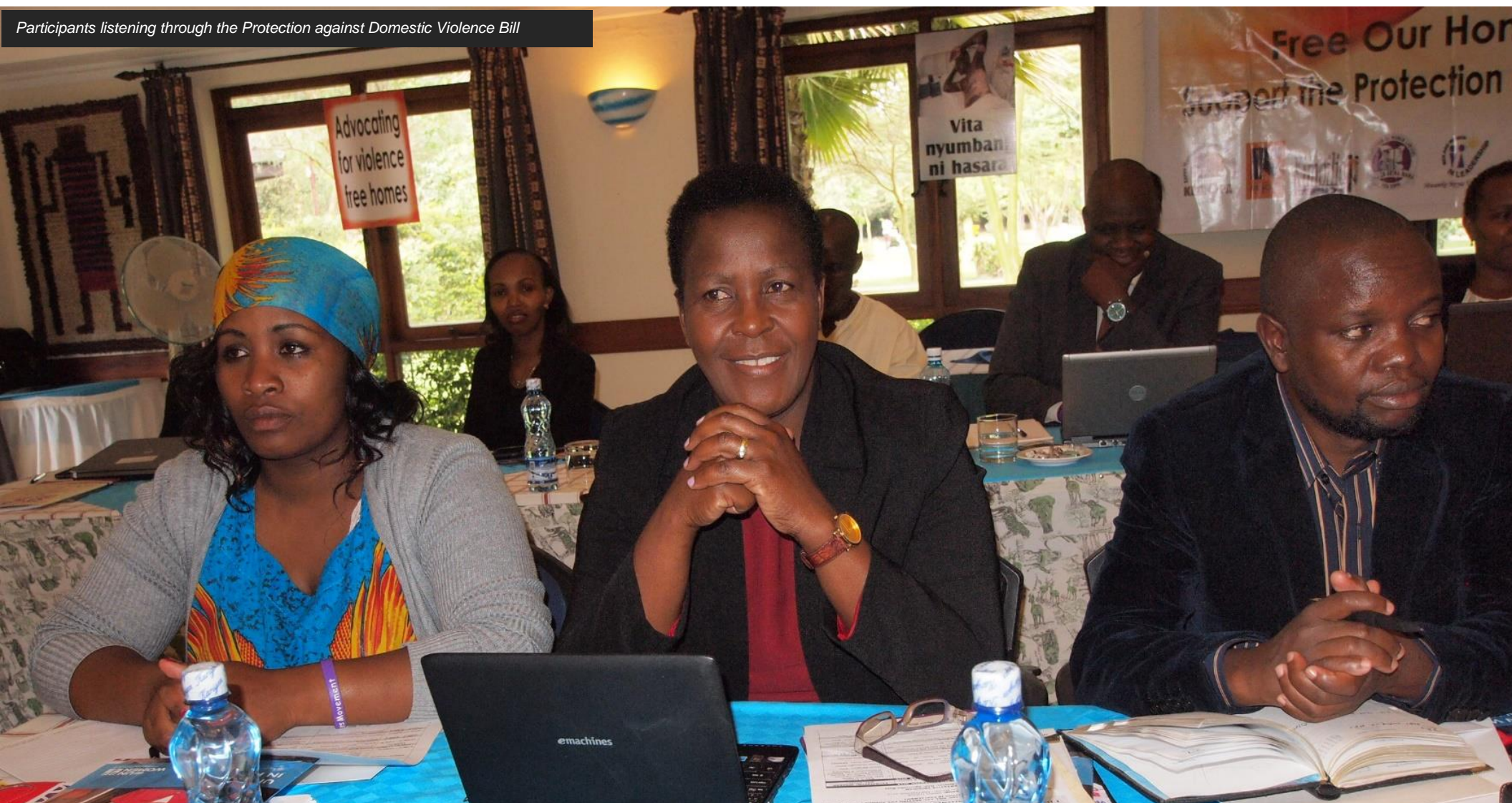
Participants listening through the Protection against Domestic Violence Bill