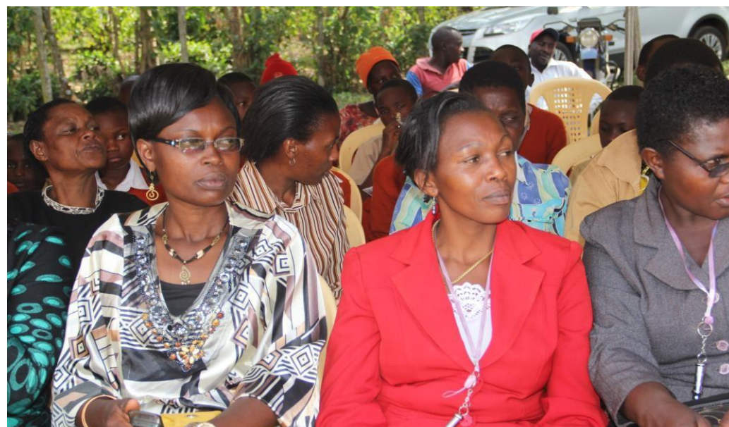
Women listening through a business and financial training activity

Access to employment is essential for overcoming inequalities and reducing poverty. Women often don't access productive work and are unable to generate an income sufficient to cover their basic needs and those of their families, or to accumulate