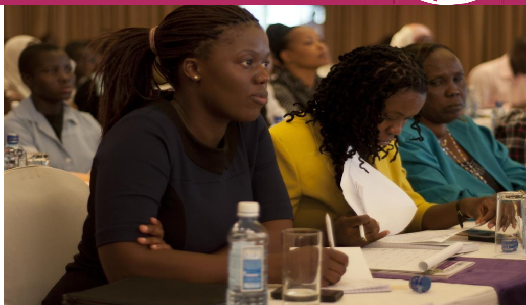
Listening through the National Action Plan process

Women's Empowerment Link in collaboration with other likeminded partner organizations including the Gender Directorate Under the Ministry of Devolution and planning through a consultative process with 21 counties developed a 10 year (2015 – 2025) National Action Plan. The National Action plan (NAP) is a tool that operationalizes the Kenya National Women's Charter and lays out the necessary measures and joint responsibilities required to attain women's equality and equity by all the relevant stakeholders. In particular, the National Action Plan seeks to: Fast track the implementation of the gender gains in the constitution in relation to the charter priorities; Promote accountability by duty bearers, leaders and other actors' efforts in protecting women's human rights; Develop timeframes on the implementation of the National Charter priorities and Provide indicators for government agencies and civil society while aligning with other national plans.