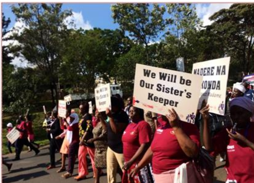
Women demonstrating during 16 Days of activism campaign

All our partners have a strong local focus on preventing gender-based violence and supporting survivors of violence. This year, we worked with women from all borders to provide counselling and referral services, as well as access to safe houses for women and their children.