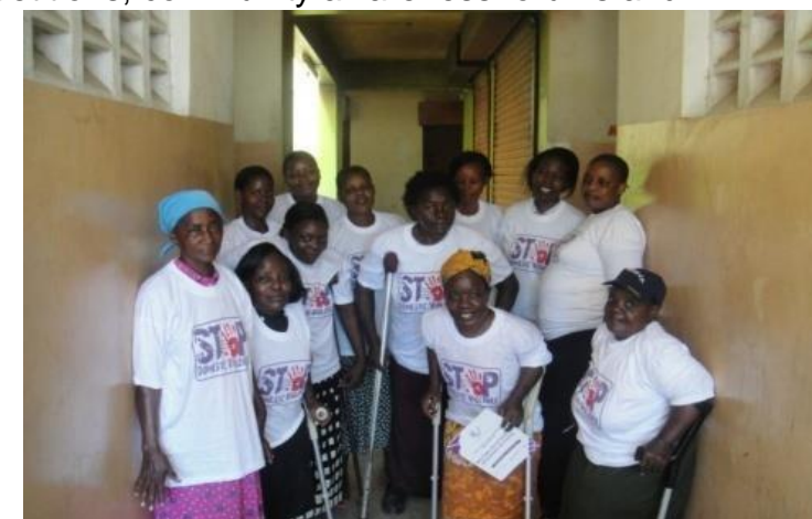
Tunaweza PWD women engage in a group discussion