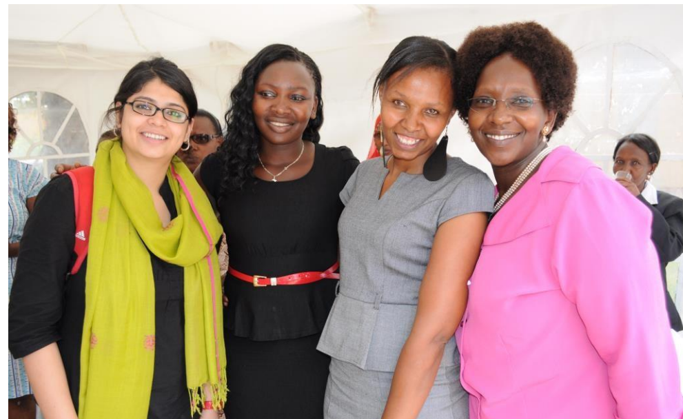
Young women leaders during a training session

WEL embarked on a mission to enhance the participation of young women at the national and grassroots level by increasing their understanding of gender and other related concepts and policies; the Constitution, promoting gender equality and young women empowerment in Kenya and identifying opportunities for engagement and further enhance the capacity of young women leaders on networking, political and civil engagement at the national and the county level and strategic advocacy for policy and social change. A network of young women leaders was formed to act as a platform for coordination and collaboration for the activities they set to undertake. Secondly, there was an increase on the awareness of the opportunities and positions for political leadership that had been created by the new constitution and other legislations both at county and national level. A majority of the trained women have initiated a number of campaigns geared towards ensuring gender equality, women's empowerment and are actively participating as social change agents in their communities as highlighted below: