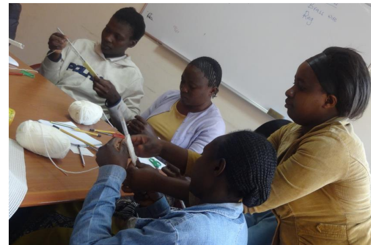
Creative tailoring using wool