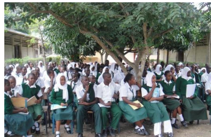
Students of Miritini Secondary listening to the session