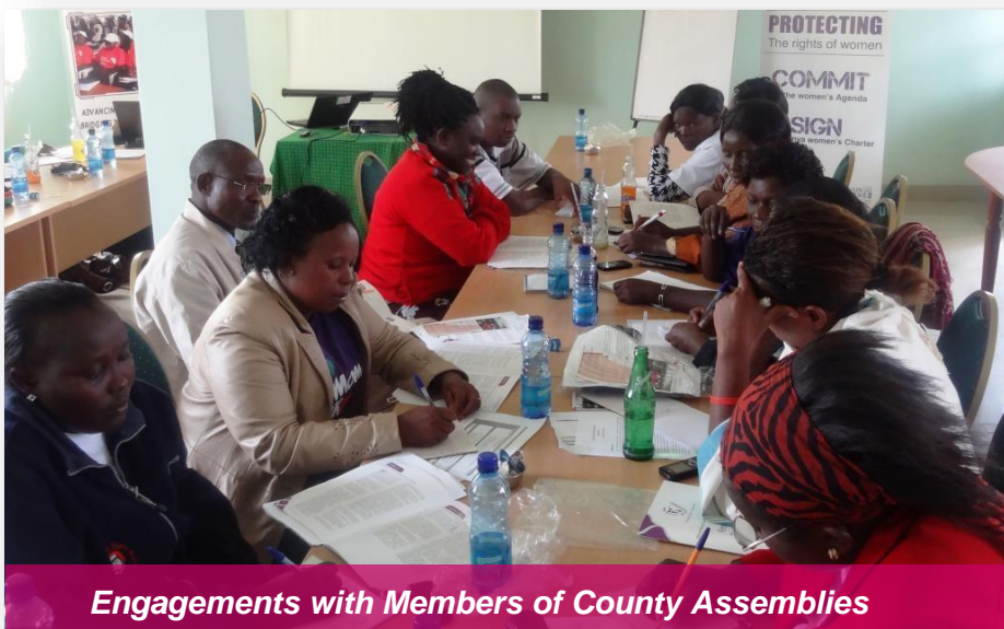
Engagements with Members of County Assemblies

Conducted intensive and extensive civic engagement with the representatives of women and women leaders in Five Counties; Embu, Lamu, Kajiado, Nakuru, Machakos, Mandera and Siaya to accelerate and increase awareness on the National women's charter priorities. Further, we built their capacity to engage with decision and policy makers in the counties especially in regards to planning and the budgeting processes. During the implementation of this project, it was noted that whereas the constitution demands for the participation of citizens into these processes, the leadership at the counties are not involving the citizenry, for instance, we have realized that the notices on meetings to discuss budgets are posted less than 12 hours to the meeting thereby denying the citizens ample time to prepare and have effective engagement with the process. To this end we have called for proper information sharing from the respective offices and are in the process of seeing how we can leverage on technology to improve information sharing between right holders and duty bearers.