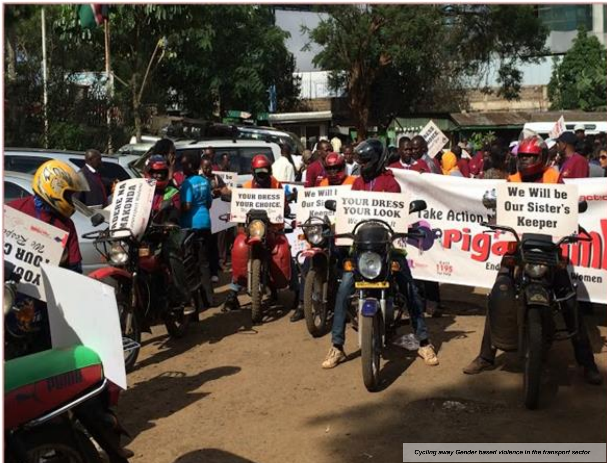
Cycling away Gender based violence in the transport sector