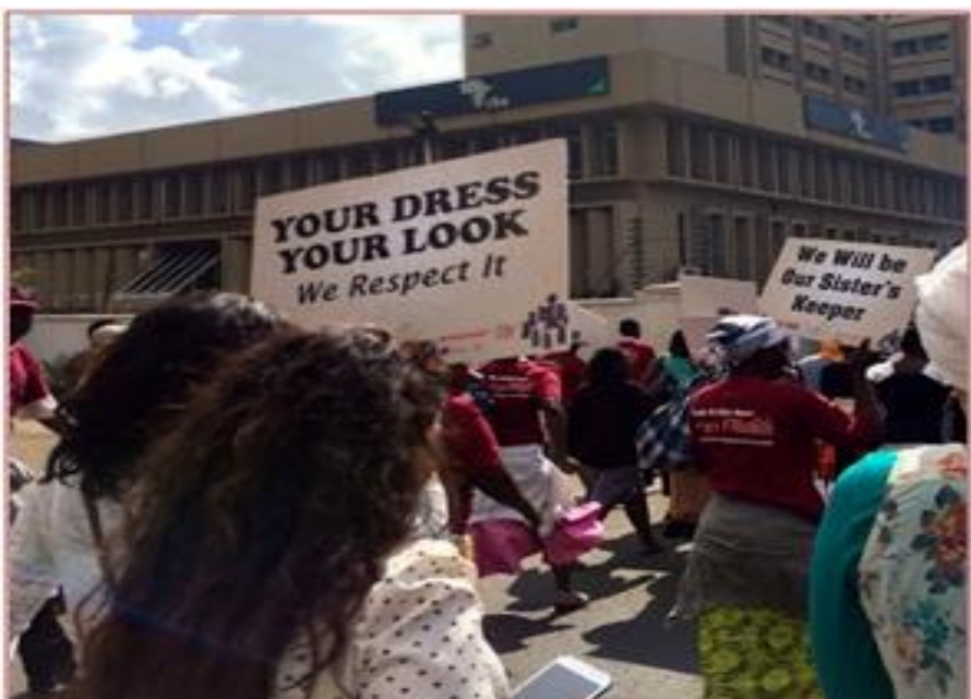
Campaign to end gender based violence