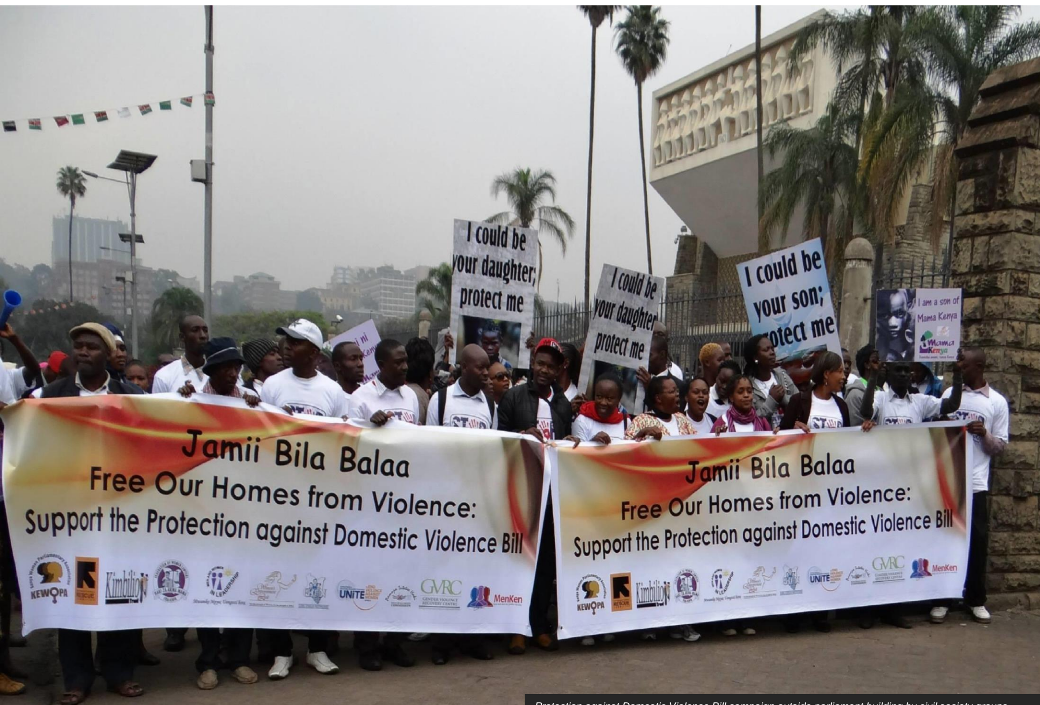
Protection against Domestic Violence Bill campaign outside parliament building by civil society groups