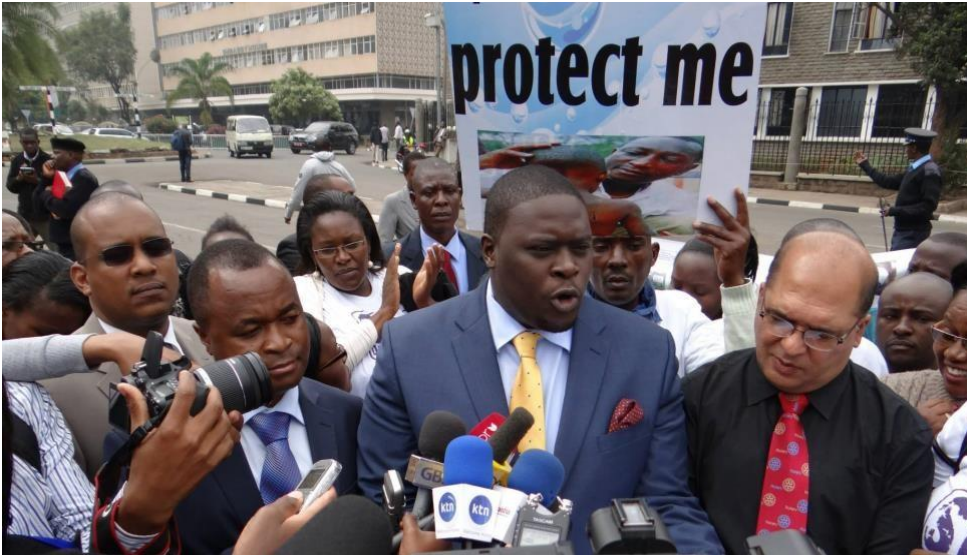
Members of Parliament addressing the Media on the PADV Bill

Mobilized support and consensus among different stakeholders for the Protection against Domestic Violence Bill. In this regard 11 media briefs were held to publicize the need for a law that protects individuals against Domestic Violence and a high level advocacy meeting with the members of the National Assembly especially the Justice and Legal Affairs Committee and the Kenya Parliamentary Human Rights Association that offered technical insights and strategies on how to ensure the Bill goes through the Three readings in the House. The Bill is awaiting the third reading and more than ever in the history of Kenya, we are near getting a law on protection against domestic violence since independence and 20years later since the first Bill was tabled in parliament. In this journey of advocating for this Bill, we worked through partnerships to leverage on the strengths of each stakeholder and have a concerted voice across the society. Working with members of parliament was particularly